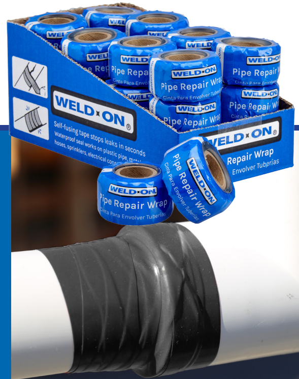
Pipe Repair Wrap, 1"x10', 20mil SKU# 16312: Black | SKU# 16445: Clear